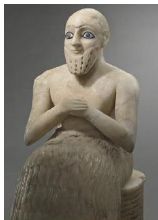
(fig .1) AO 17551 A