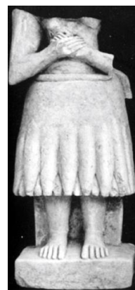
( fig .9)Frankfort, More Sculpture pl.7c