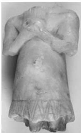
( fig 2) Frankfort. More Sculpture, pl 18