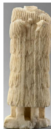
(fig 32) AO 17560