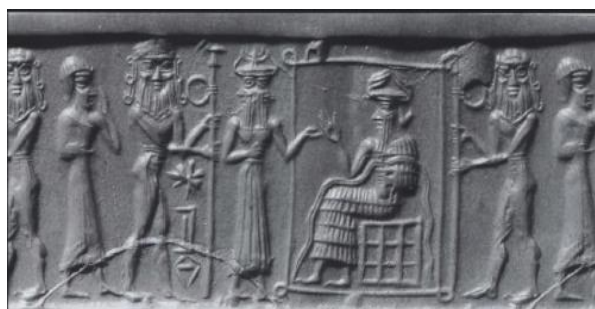
(fig .36) Aruz. Art .no 141