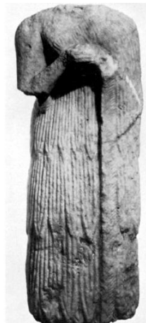
(fig.29)Frankfort: More Sculpture pl.38-d