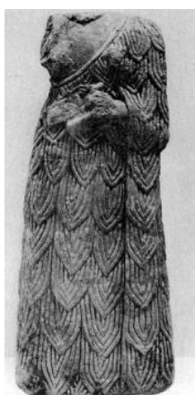
(fig30)Frankfort. Sculpture, pl. 77e