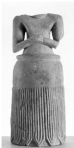
(fig 12) Frankfort, Sculpture, no. 24