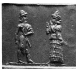
(fig 39)Frankfort , Cylinder ,no908