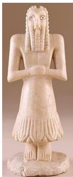
(fig.5)Aruz. Art. fig.24b