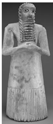
(fig 8) Met Mus of Art. 1952no.6