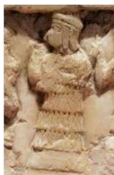
(fig 37) Penn.M. B16665