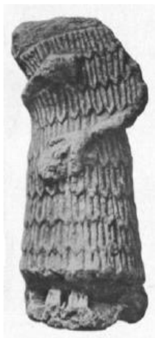
(fig 27) IM19769