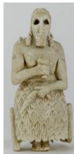
(fig 16) Frankfort . Oriental, fig 80 (fig 17) Frankfort. Oriental. Fig 86 (fig 18)Marchetti, Mesopotamian. Fig 8