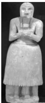
(fig.7)Frankfort Sculpture,pl 31