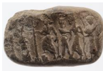
(fig.40)Penn.m B8077 Legrain. Some Seals,no. 2