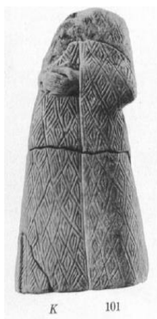
(fig 31) Frankfort. Sculpture, Pl 70, k.101