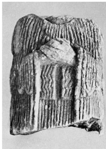
(fig.24)Frankfort: More Sculpture, pl.23-c (fig.25) Marchetti.Meso.fig.10 (fig.26)Parrot,Le Temple.no.2178