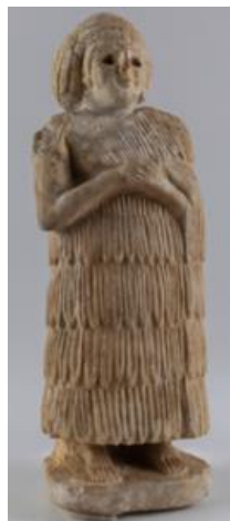
(fig 28)OIM . A11441