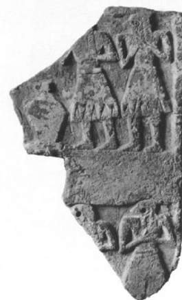
(fig3) Frankfort, Sculpture, pl 110