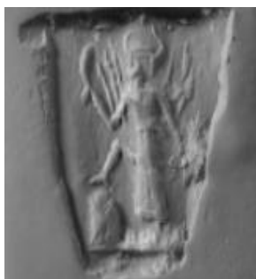
(fig .35) Frankfort. Cylinder. no. 627