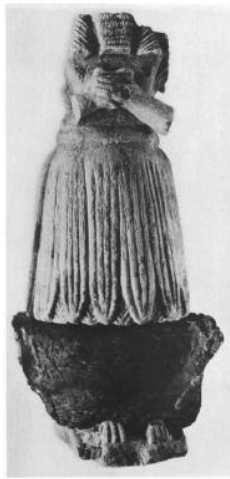
(fig 13) Frankfort, Sculpture, pl 39.b