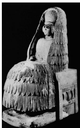
(fig .33)Parrot. Le Temple, p96-97,pl.XLVIII-L