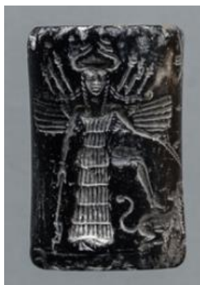
(fig 34) OIM A27903 Braun-Holzinger ,Mesopotamische,p355