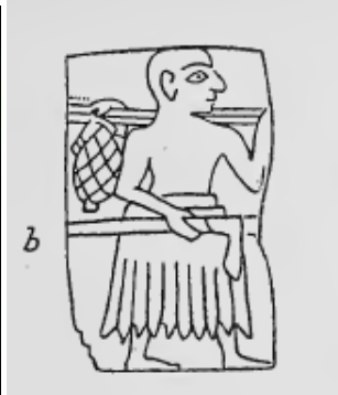
(fig 11) AO 203 ; Heuzey, Catalogue, n° 224