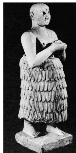
(fig 21)Woolley Ur IV.pl 40 .B 5 (fig.22)Parrot. : Le Temple, pl.XXII, (fig.23) Woolley, Ur II. pl 116