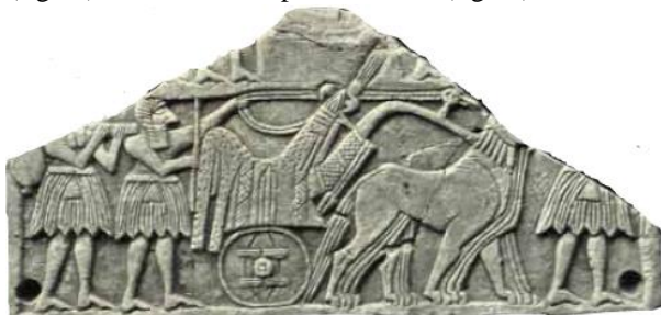
(fig 15) Woolley, Sumerian art, fig 45