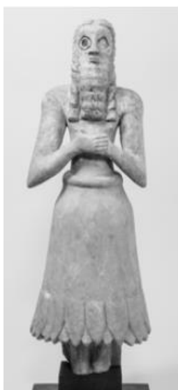
(Fig.4) Frankfort, Sculpture ,pl.46