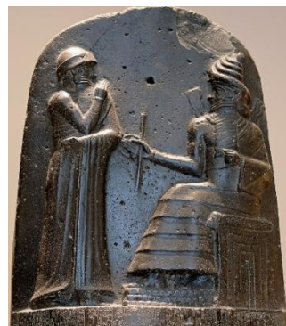
(fig.38) louver . SB 8; AS 6064