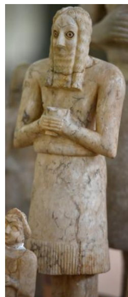
(fig .6) Frankfor, Sculpture,pl 8