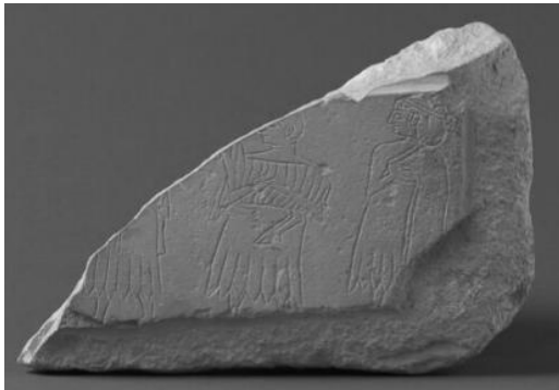
(fig .10) AO 3290 ; Heuzey, Catalogue, n° 215